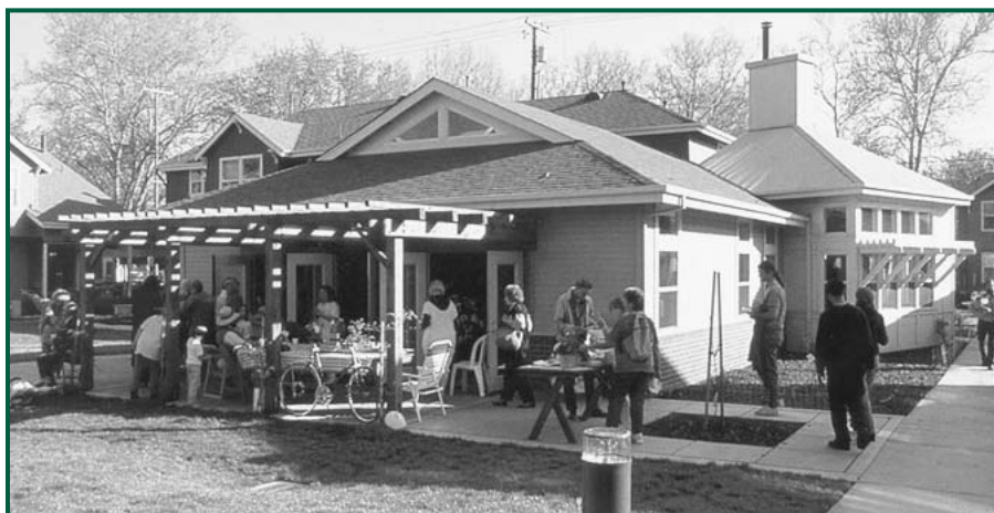
Southside Park Co-housing in Sacramento set aside five of its 25 units for low-income families, six for moderate-income, and 14 for market rate. Public financing helped capitalize the affordable units, and leveraged the investment of two private and one nonprofit lender.

California laws can also be changed through the initiative process. The number of valid signatures required to independently place a measure on the statewide ballot is different for regular statutes and constitutional amendments. For the 2006 ballot, 373,816 valid signatures are required to place a statutory measure on the ballot, and 598,105 valid signatures for a constitutional amendment.