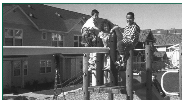
Matsusaka Townhomes were capitalized by a loan from the State of Washington Housing Trust Fund. The community-design process resulted in 26 two-, three-, and four-bedroom apartments, with communal space focused on children.

Massachusetts' state Affordable Housing Trust Fund (AHTF) targets people at or below 110 percent of the area median income (AMI), but gives preference to housing that is affordable to those at lower AMIs and projects that ensure 30 or more years of affordability.