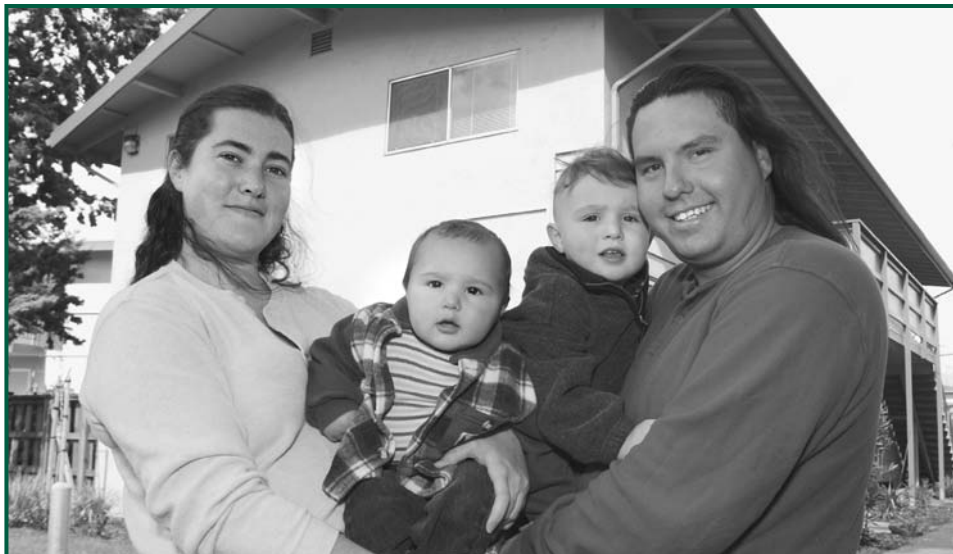
A dedicated revenue stream can capitalize mortgage assistance programs for first time homebuyers.

approximately $12. 50 A $25 to $100 surcharge on the cost of California real estate transactions could generate between $320 million and $1.2 billion annually.