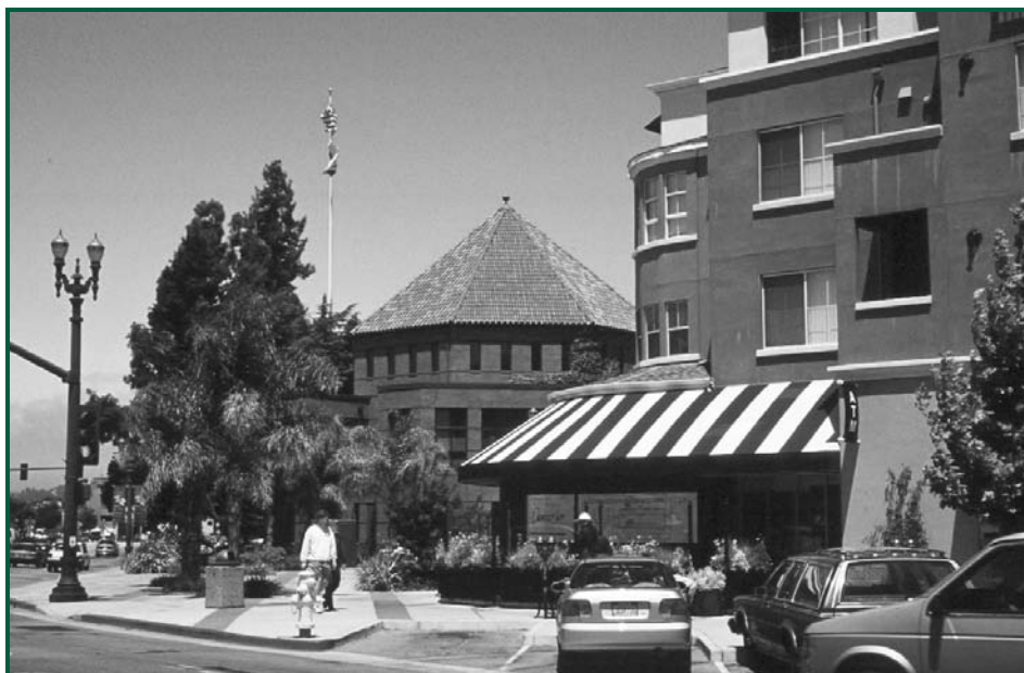
Dedicated revenue sources can prioritize smart growth development like this Redwood City Center that locates affordable housing near transit and commercial amenities.