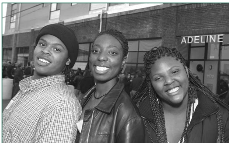
Adeline Lofts hosts 38 one- to three-bedroom live/work lofts for low-income families. The Affordable Housing Association development is as diverse as Oakland itself, housing dancers, musicians, poets, designers, and 43 children.

Accountability provisions can help to protect the trust fund over time. Ongoing review provides needed information about the effectiveness and impact of state housing trust funds. The Shimberg Center for Affordable Housing at the University of Florida receives designated support from the state housing trust fund to gather data, track affordability, and report to the legislature on production numbers. The Washington Housing Trust has run a public education program, publicizing their accomplishments annually. And the Massachusetts Community Preservation Coalition prepares an annual report to the state legislature to maintain support.