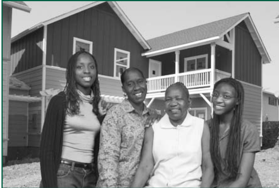
A California Housing Trust Fund could extend the financing of "self-help housing" (housing built by owners, volunteers, and nonprofits) that Proposition 46 bonds currently support.

With an estimated need of 1.95 million to 2.2 million new homes between 2000 and 2010, 37 California will need reliable resources to ensure that new housing production can serve the full range of income levels. Given the depth and breadth of the affordable housing crisis, California needs to join the ranks of 28 other states that have dedicated revenue sources for statewide affordable housing production. 38