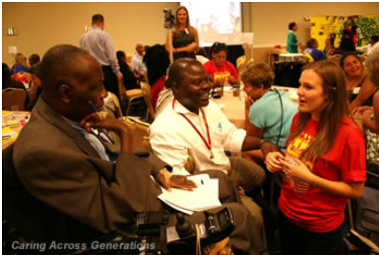
Workers, consumers, and organizers gathered at a Care Congress in Washington, D.C.

They labor in the shadows, caring for our grandparents, our disabled veterans, and others who require help with daily activities. Now, as the need for home care soars, a national campaign is working to reshape the industry to create millions of good jobs, reverse longstanding inequities for workers, and deliver high-quality services.