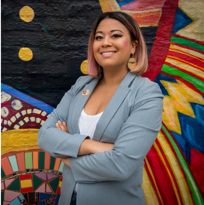
Councilmember Mitra Jalali St. Paul City Council Ward 4