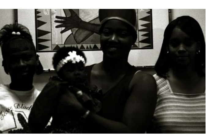
New Orleans' participants access useful resources in their consortium meetings—health education, career support, and leadership training.

Community involvement strategies continually enhanced program capacity. Many consortia were able to modify programs, expand services or significantly enhance delivery systems as a result of input from participants. This input was not limited to consortia, but included other mechanisms as well, such as focus groups and satisfaction surveys. During the initial planning phase, programs received a great deal of community input. For many programs, input was also solicited during Healthy Start's annual application cycles and during critical budget cuts. The framing of and prioritization of program services constituted critical roles of community involvement at several Healthy Start sites. In Pittsburgh, Healthy Start program staff attested to the frequency and authority of consumers' participation in most program planning and implementation activities. Staff attributed the creation of two residential programs