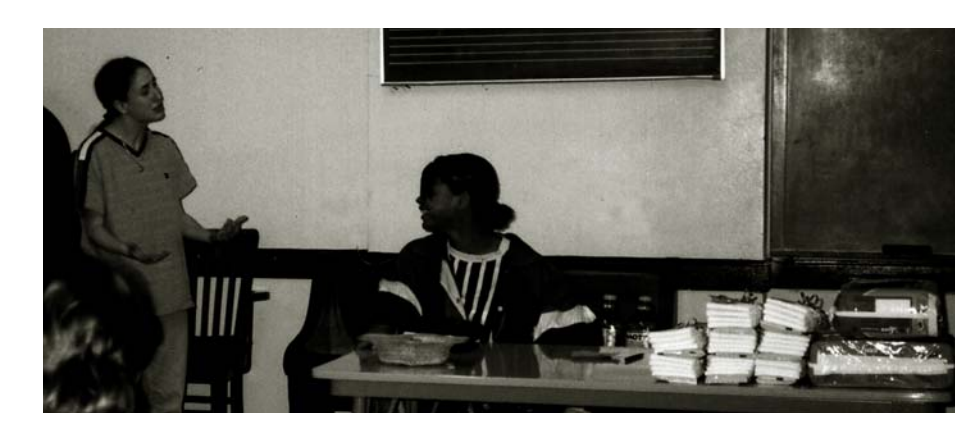
Healthy Start consortia meetings typically present health training in an upbeat, interactive atmosphere.

101 Broadway Oakland, CA 94607 510-663-2333 info@policylink.org www.policylink.org