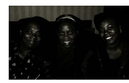
Participants form crucial support networks through their attendance at consortium meetings.

In sum, a variety of conditions appeared to provide fertile ground for well-functioning consortia and other community involvement activities. Laying careful groundwork by building trust, paying attention to community needs and issues and in other ways creating a real sense of ownership appeared to be critical. Table 2 (page 38) provides a concise summary of this diverse but interrelated group of factors facilitating community involvement in Healthy Start consortia and related activities.