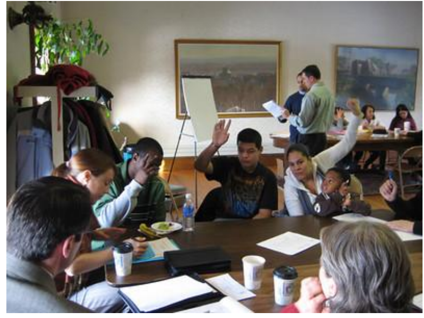
Seattle/King County FEEST