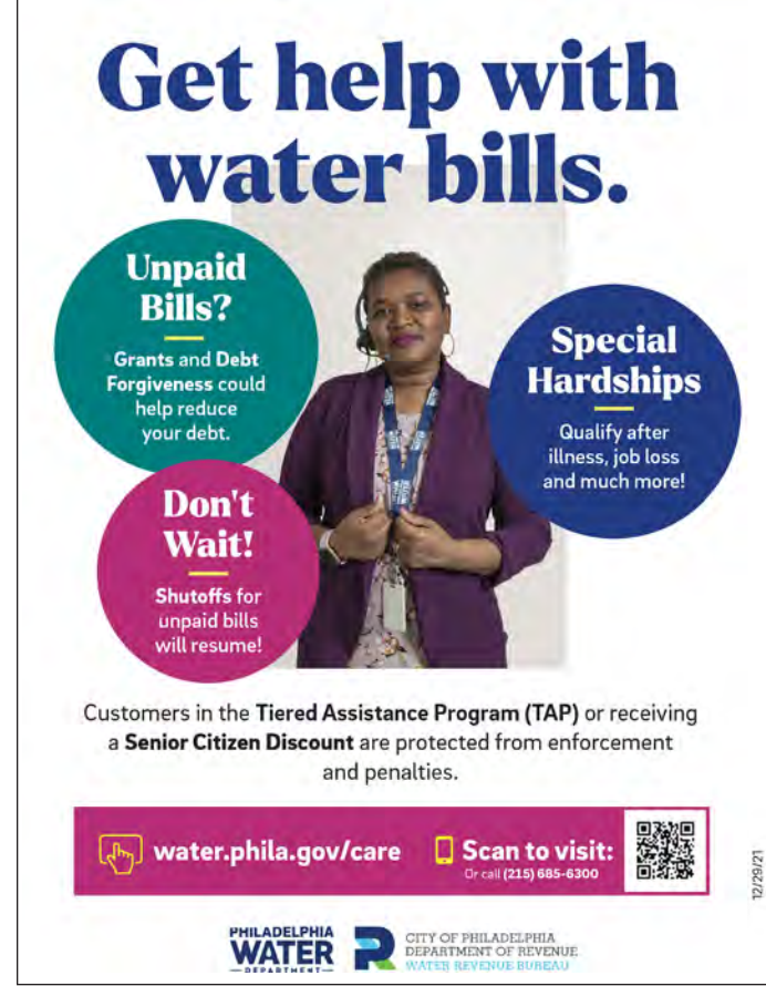
An informational flyer promoting the Philadelphia Water Department's (PWD) Tiered Assistance Program (TAP).

Evidence suggests that TAP has improved water affordability in Philadelphia. Enrollment for TAP significantly exceeds that of the city's previous Water Repayment Assistance Program (17,148 households as of 2022 versus around 10,000 for WRAP).<sup>23</sup> Importantly, enrolled households receive a bill that is genuinely affordable in that it is limited to a percentage of monthly income. However, enrollment still lags far below the estimated number of eligible households (around 60,000).<sup>24</sup> The Water Department and advocates are engaged in ongoing efforts to improve outreach and recruitment.<sup>25</sup>