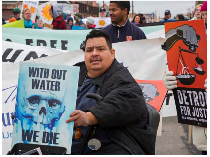
A protester at the Detroit March for Justice in Detroit, Michigan, on October 2, 2015.

Moreover, when a shutoff causes housing instability, it can harm worker productivity and disrupt schooling for students.<sup>10</sup> Prolonged shutoffs can also lead to